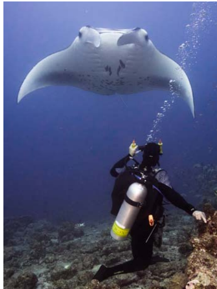
Best of Show (Maldives)