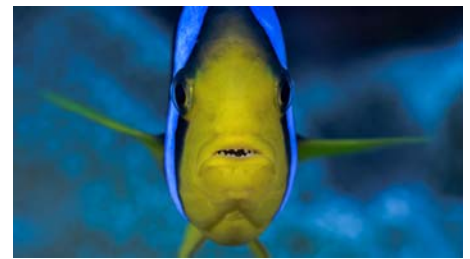
Clownfish staredown (Yap)