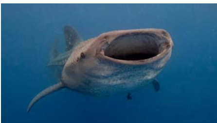
Whale Shark feeding (Isla Mujeres)