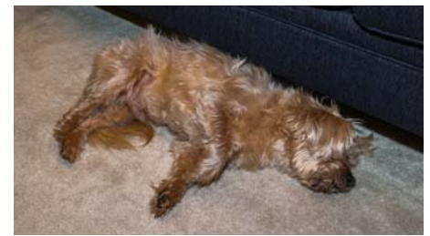
Oliver the Wonder Dog as our content manager