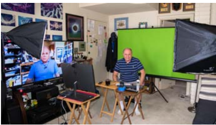
Virutal Ch-Day 2021 entire setup