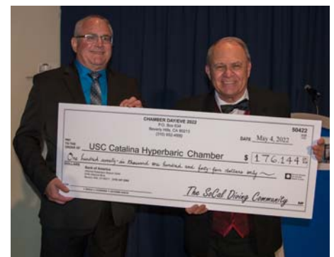
This is how we keep our Chamber funded