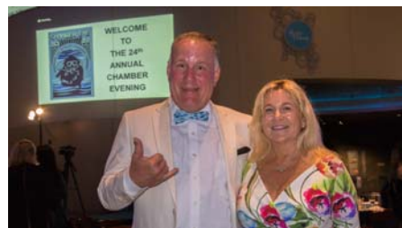
2022 Grand Prize winner T&C Aggressor trip