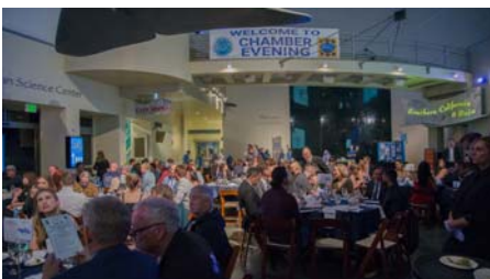
Dining in the Great Hall of AOP