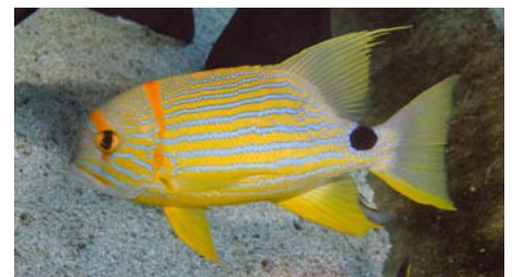
Stuart Sailfin Snapper