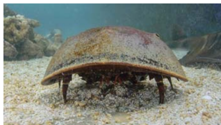
Harry Horseshoe Crab