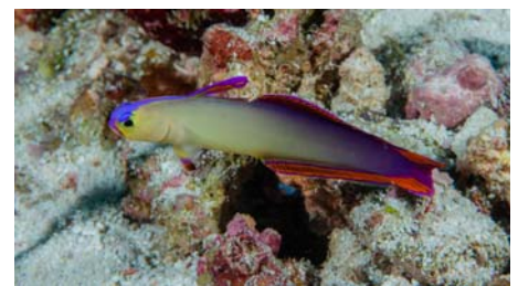
The elegant Decorated Dartfish