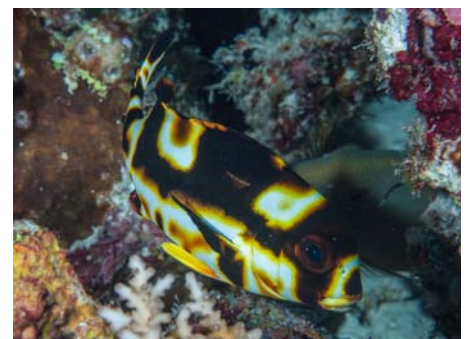
Juvy Oriental Sweetlips