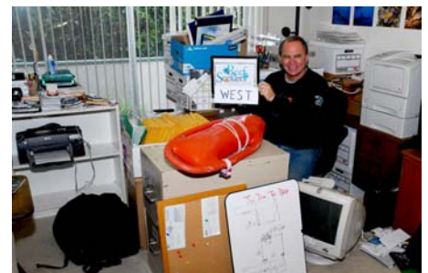
Reincarnated in Westwood where we are to this day