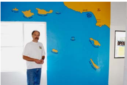
No way to save the hand-painted wall map