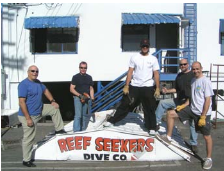
Our beloved shed in the back