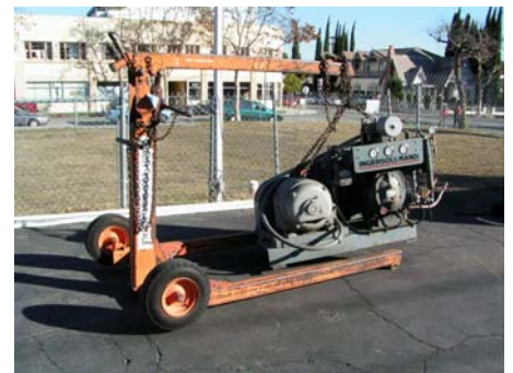
Moving the (very heavy) compressor