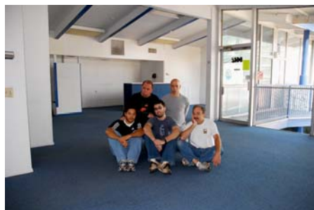
Our final moments at 8612 Wilshire