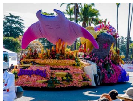
Magnificent Manta Ray