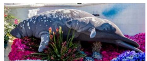
Mom and calf Manatees