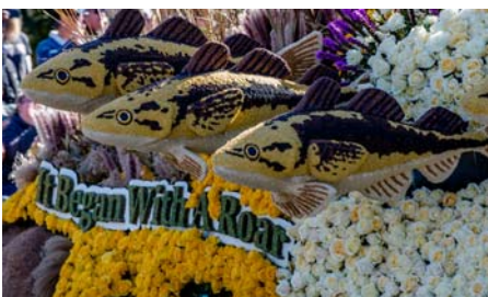
A trio of flowerfish