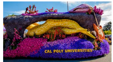
Cal Poly Moray Eels