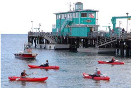
The Kayak Patrol at the ready