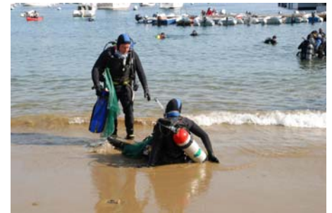
A less-than-graceful entry