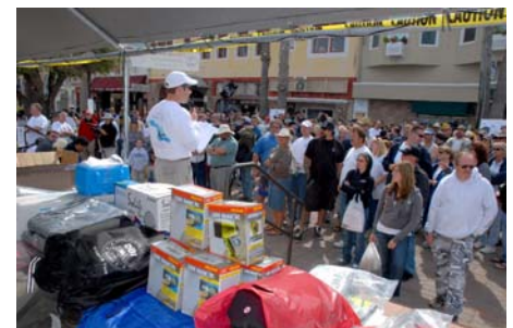
The crowd awaits the awarding of raffle prizes