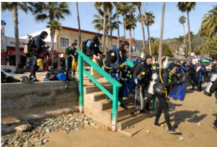
Off they go at the Green Pier