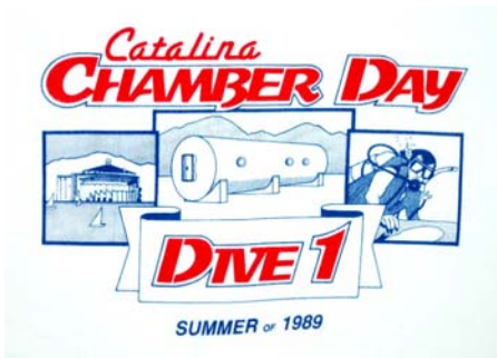
Chamber Day 1989 (the first one)