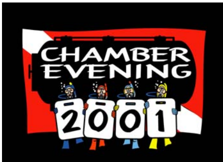
Chamber Eve 2001