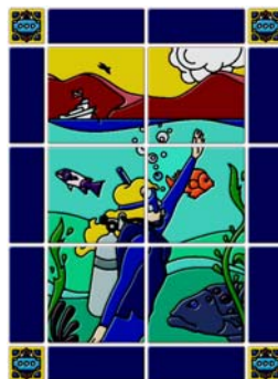
Chamber Day 2005