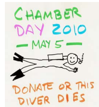
Rare look at rejected 2010 suggestion