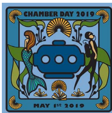
2019