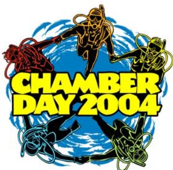
2004 (by Craig Ehrlich?)