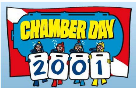
2001 (by Craig Ehrlich)