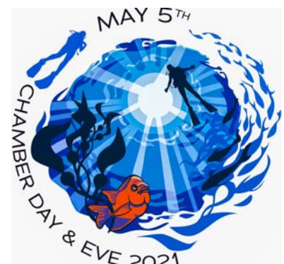
2021