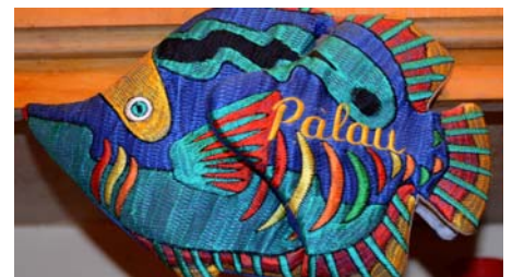
Palauan Potholder fish