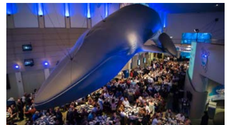
The view from on high