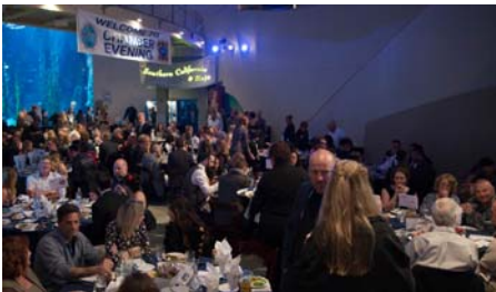
The view from the podium