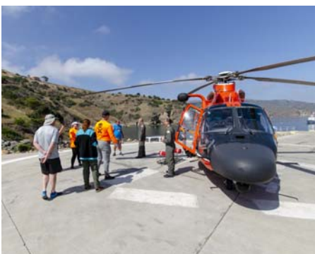
USCG helicopter on the pad