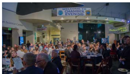
Dinner at the Aquarium of the Pacific