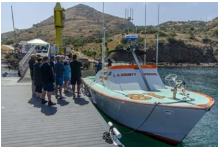
Talking to Baywatch