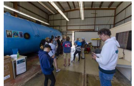
Inside the Chamber hangar