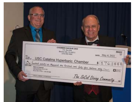
The end result Wow!!!