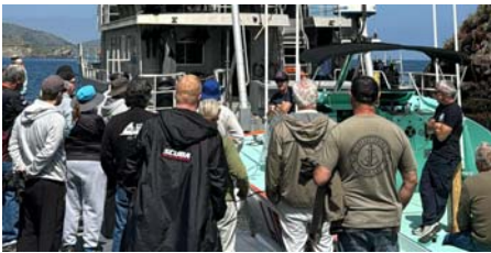
Chatting with rescue folks at the Chamber dock