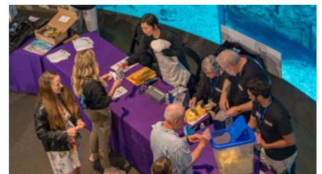
Feeding frenzy at the raffle table