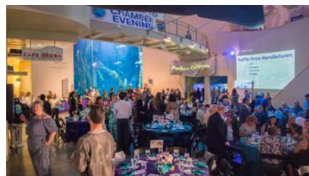
The view from the podium