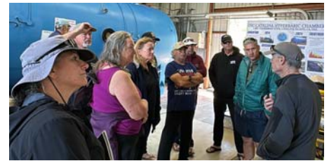
Getting briefed on going inside the Chamber