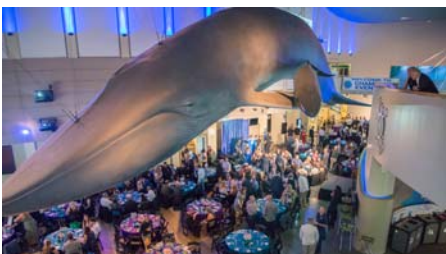
Gathering under the Blue Whale