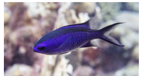
Blue Chromis (Bonaire)