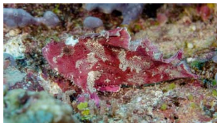
Leaf Scorpionfish (Yap)