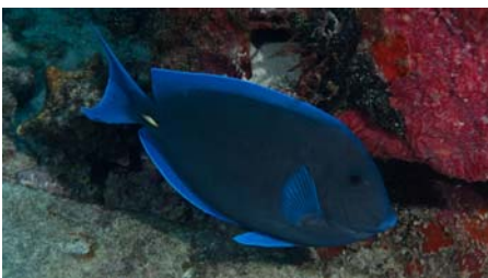
Blue Tang (Isla Mujeres)