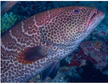
Tiger Grouper (Roatan)