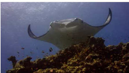
Manta Ray (Maldives)