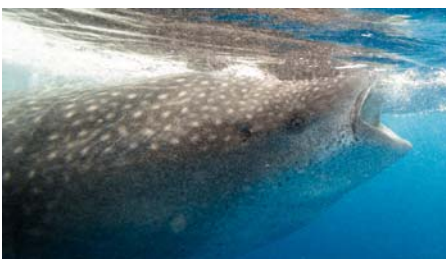
Whale Shark (Isla Mujeres)