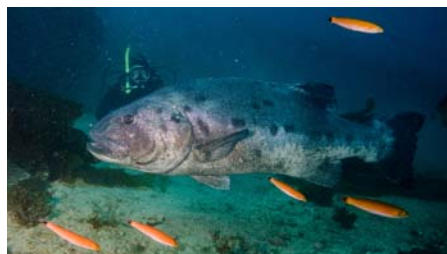
Giant Sea Bass (Avalon Underwater Park)