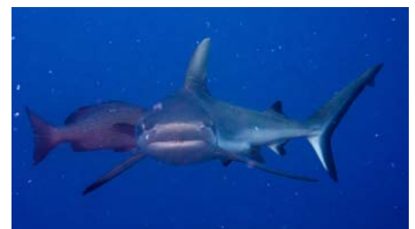
Gray Reef Shark (Yap)