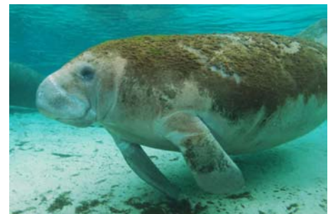
Manatee (Crystal River, Florida)