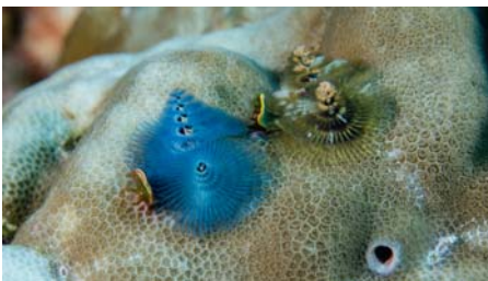
Palau with the Palau Aggressor II