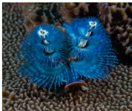
Indonesia with Murex Dive Resorts