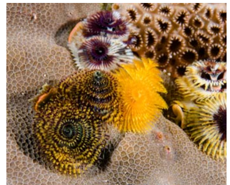
Maldives with the Manthiri