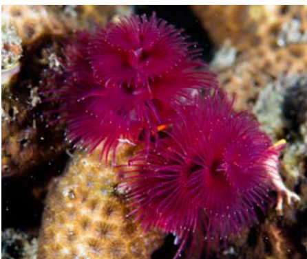
Dumaguete with Atlantis Dive Resort