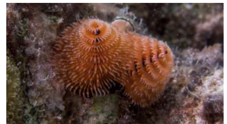
Bonaire with Buddy Dive Resort