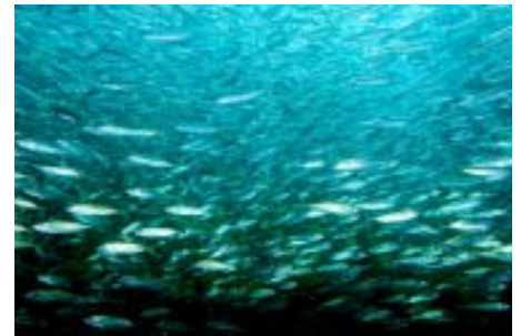
Swarming Jack Mackerel