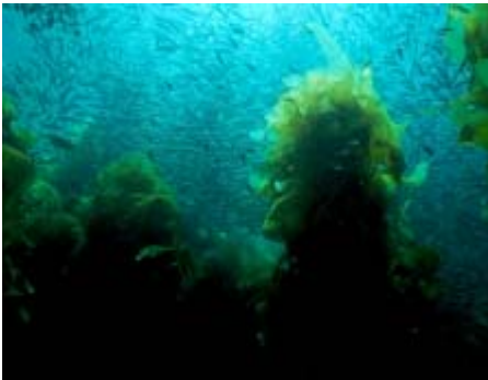
A mess 'o fish at Crane Point