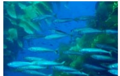
Chub Mackerel mixed into the school