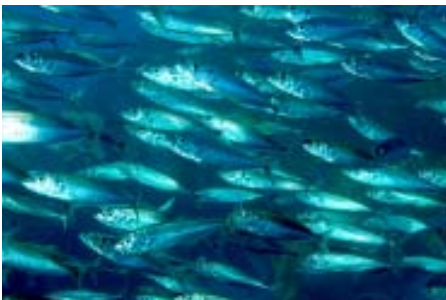
Close-up view (note spot on gill cover)