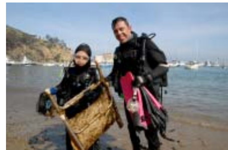
Treasures from the deep