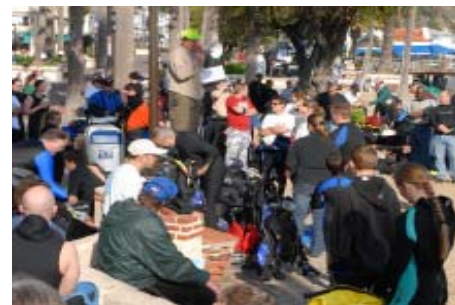
Getting everyone briefed beforehand