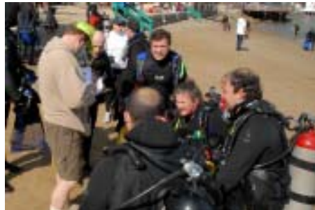
Checking back in with the on-shore DM