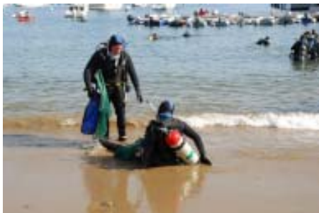
Fall down go boom!!! (Not one of ours . . .)