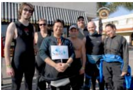
Part of our group of intrepid trash-hunters