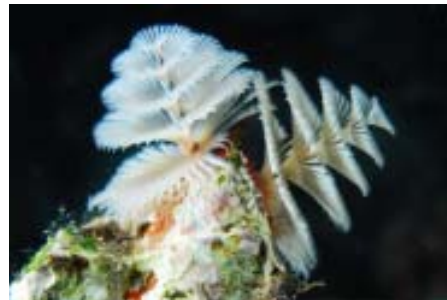
(Happy Holidays . . .