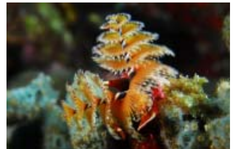
. . . for those who celebrate something else.)