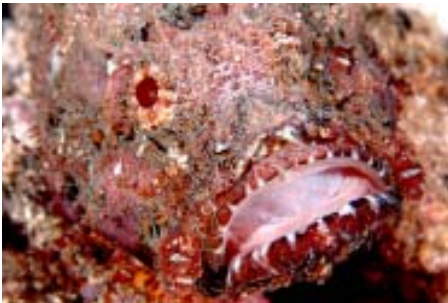
Scorpionfish in the Sea of Cortez