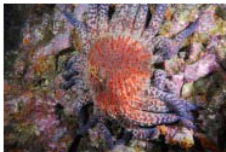
Sunflower Star at Santa Barbara Island