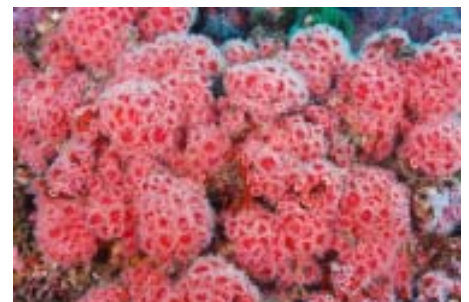
Club-tipped Anemones at the Oil Rigs