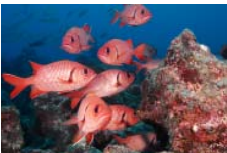
Bigscale Soldierfish at Cocos Island