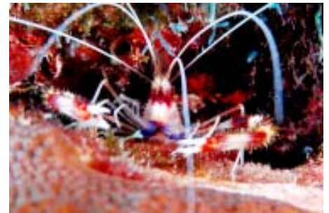
Banded Shrimp in Bonaire