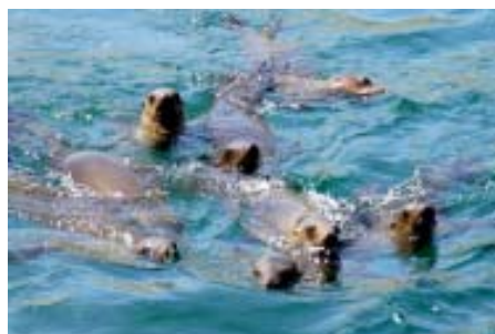
The welcoming committee