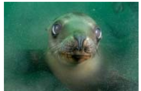
Checking out his reflection