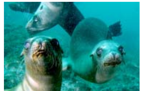
Coming in for a closer look