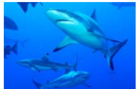
Reef Shark close encounter