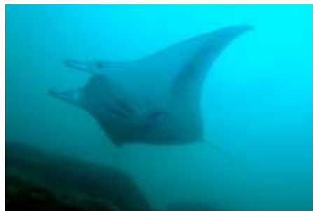
Manta gliding in to get cleaned