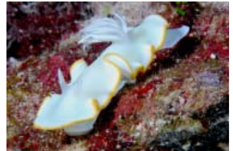
Really pretty (and large) Nudibranch