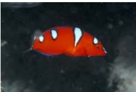
Juvenile Yellowtail Coris